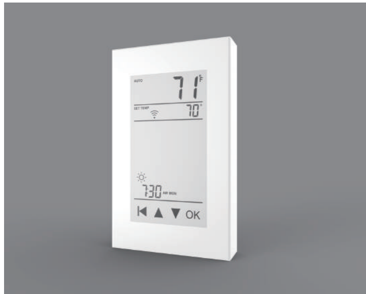
ET-72G(W) English V1.2